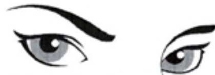
The Study of reading the Iris is called Iridology

These nerves run up your legs, up your spinal column, through your brain, and leaves a fingerprint on your iris, the colored part of your eye.